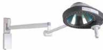
Mobile OT lights