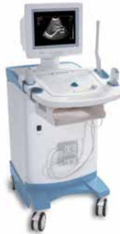
Ultrasound Machines B&W