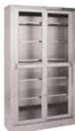
Medical Cabinets Cupboards