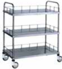
Instrument Trolley Stainless Steel