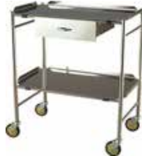
Instrument Trolley with Drawer