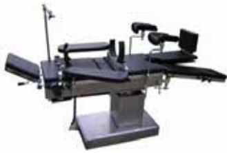
Hydraulic Operating Table