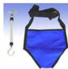
Baby weighing scale, spring type