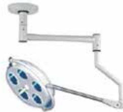
Ceiling OT lights Double Dome