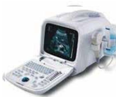
Ultrasound Machines - Desktop